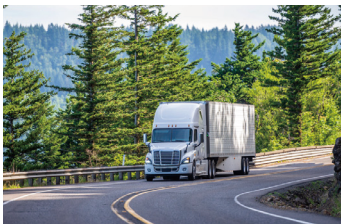
Asset & Logistics